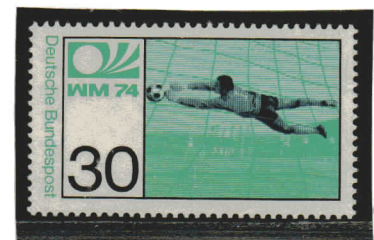
Issue date 06/14/1974