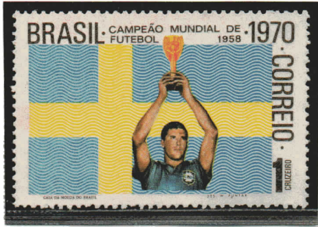
1958: Brazil's first time

In 1928, before the first edition of the Football World Cup, FIFA defined the Coupe du Monde cup (figure of the Greek goddess of victory, with stylized wings and raised arms holding an octagonal cup) as a prize for the winning teams. The country that first won 3 editions would have the definitive possession of the cup. In 1946, the cup was renamed the Jules Rimet Cup, in honor of the creator of the competition and FIFA President. After the 3 titles of the Brazilian National Team, a new cup was presented in 1974 with the name FIFA Cup (two human figures holding the planet Earth). The new cup will only be replaced after the year 2038, when the space for the names of the winners in its footer runs out.