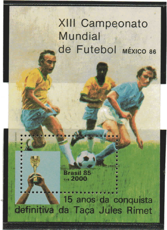
1985: 15 years since the definitive conquest of the cup that bore the name of the president of FIFA which created it