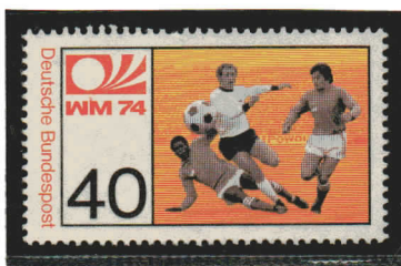
Issue Date 06/14/1974

Played in 9 cities by 16 participating teams, the edition was marked by the first player sent off in World Cups: Carlos Caszely, athlete from the Chile national team in a match against the hosts. In the match Yugoslavia 9x0 Zaire, the space for information on the electronic scoreboard of the Parkstadion stadium ran out. West Germany reached the second championship with a victory over the team considered the best in the world: the Netherlands of the legendary Johan Cruyff. The German Post Office issued only 2 stamps in commemoration of the event.