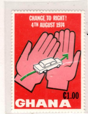
THESE SET OF THREE STAMPS DEPICT THE LANE CHANGING OCCASION.