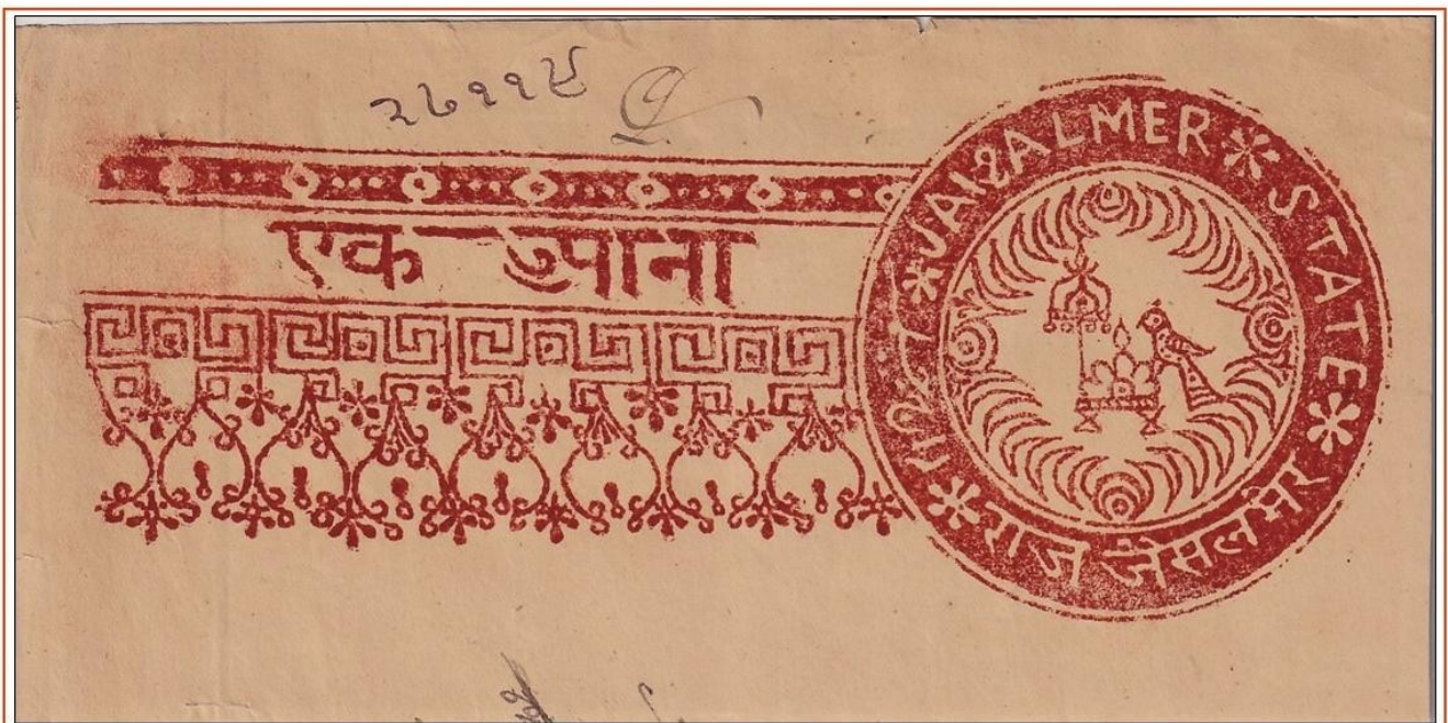
Circa 1932. British India Fiscal Revenue Court Fee Princely State Jaisalmer Stamp Paper 1An Revenue Type 28. Peacock in the coat of Arms

It is another type of migration. Ornithologists generally concur that irruptions are triggered by food shortages , such as failure of the coniferous cone crops over a large geographic area, a common phenomenon in Peacocks. COAT OF ARMS WITH STYLIZED BIRD.