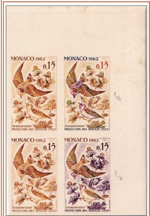
Composite progressive color trial Imperf corner block.