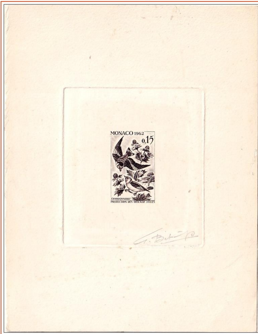
MONACO (1962) European goldfinches*. Die proof in black signed by the artist LAMBERT and the engraver BETEMPS. Protection of useful birds.

Within a species not all populations may be migratory; this is known as "partial migration". The migrating birds bypass the latitudes where other populations may be sedentary, where suitable wintering habitats may already be occupied.