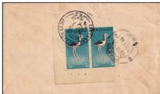
1959. New Zealand. Grey Teal 2d Pair, Health Stamps, tied to cover posted from Pakuranga Health Camp to India, by Second class Airmail. A 3d pair Pied Sillit ( Himantopus leucocephalus ) also tied on the reverse →