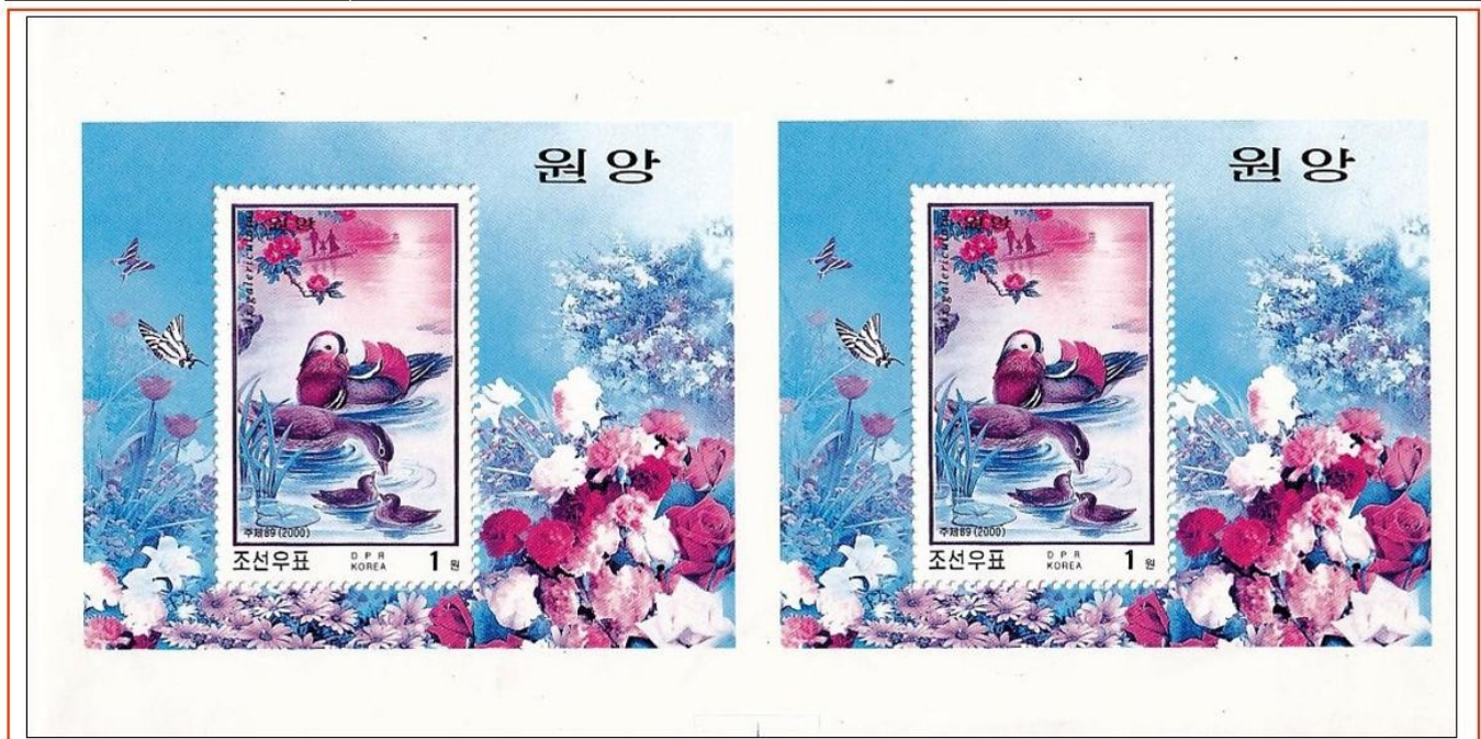
2000. North Korea. Mandarin Ducks ( Aix galericulata ) - Imperforate Pair-Printer's proof