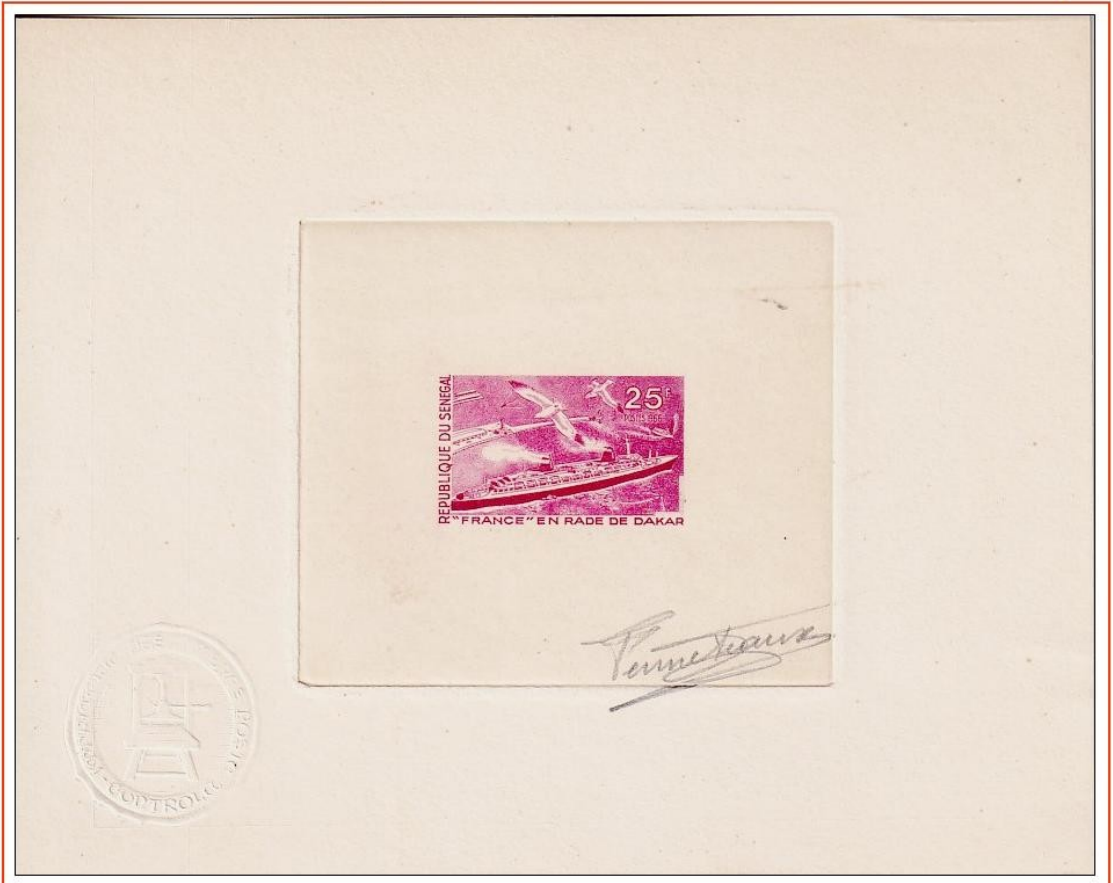
SENEGAL (1966) Seagulls*. Ship*. Die proof in violet signed by the engraver FENNETEAUX.