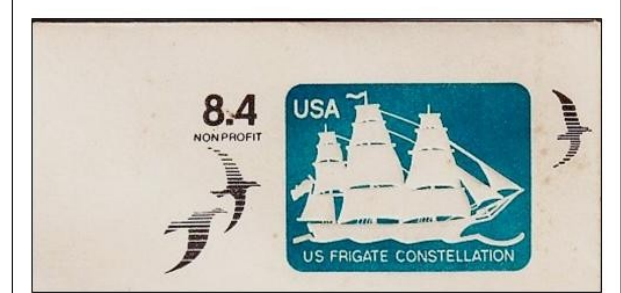
1964. USA. 8.4c Non Profit Prepaid Postage cover depicting Arctic Terns (Stylized)