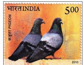
2010. India. Displayed above are few errors and color shade varieties of Pigeon (Male & Female)