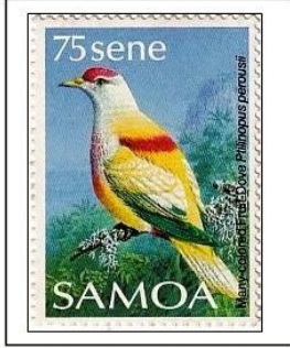
↑ Error-Color variety – Lower Left Stamp

Many colored Fruit Dove ( Ptilinopus perousii ) Issued 1.08.1988 Issued in a 10v Set of Birds