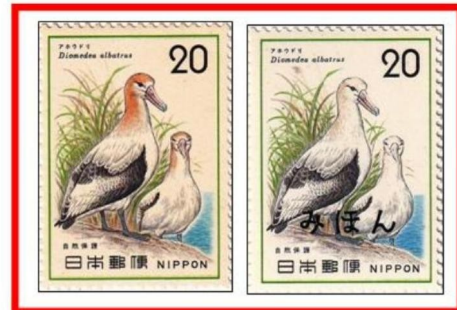
1975 - Specimen on right has a color error omission