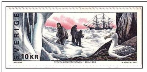
South Polar Expedition 1901-1903 Booklet Pane - Issued 2002

Unpaired birds are initially choosy. The divorcing bird can not expect to breed the following year of careful courtship.