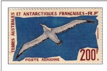
1959 - Definitive