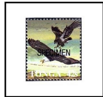
A specimen, overprinted in black. Few overprints were also done in gold, as displayed in next page.