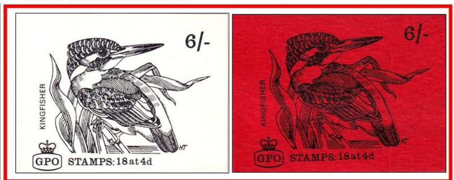
Essay proof, done for the Booklet cover, on red chalk paper board.