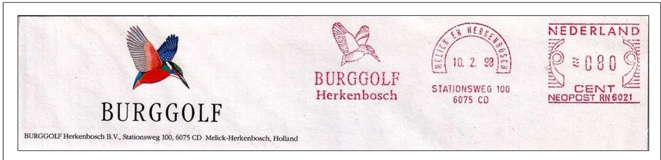
1998. Meter Top cut Netherlands, Bird-Kingfisher

The kookaburra gets its name from the Aboriginal word of the Wiradjuri people, of the area now known as New South Wales, 'Guuguuburra'. It is said to refer to the sound of human laughter. The kookaburra unleashes its famous call just before sunrise, which has led to it being nicknamed The Bushman's Clock . In aboriginal legend it is the call of the kookaburra that alerts the people of the sky that it is time to light the great fire (the sun) to warm and nourish the earth