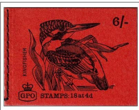
1969. Pre decimal definitive Stamp booklet