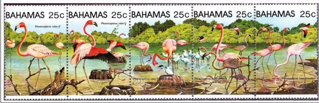
1982 - Se-tenant Strip depicts colony of flamingos. Identified as Female and Male icons on respective stamps