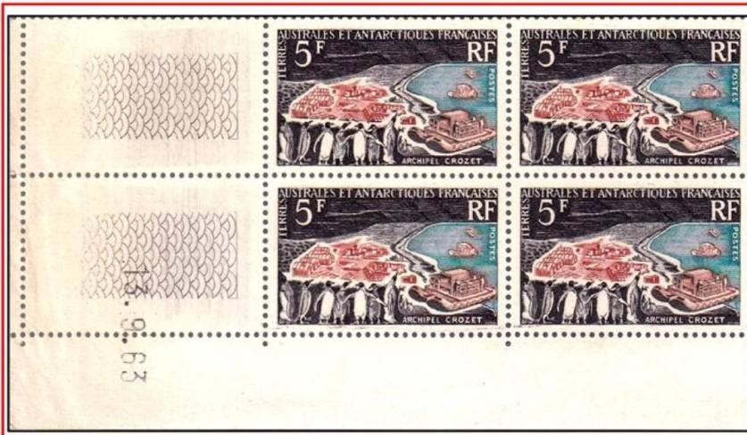
Corner Plate Block with Date of Issue and Gutter Margins