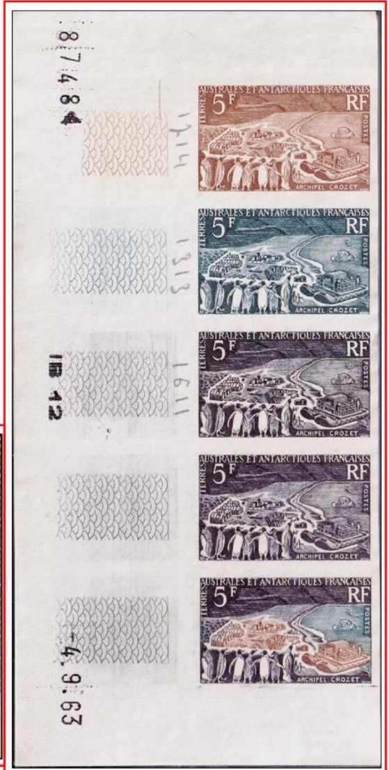
1963 - Progressive Color Trials - Marginal Plate Block with gutter margins.

Die Card with Stamp Eco Physics Expedition