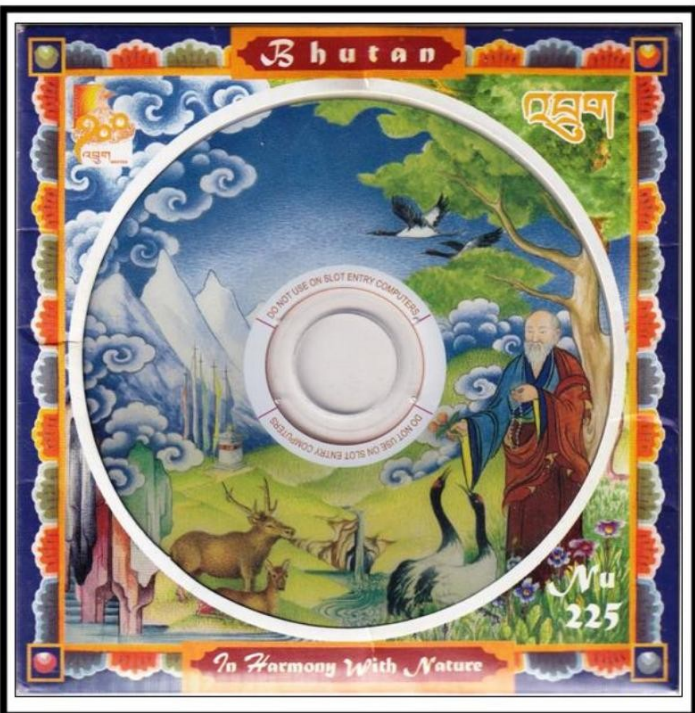
In Harmony with Nature – Record (CD) Stamps, with Jacket depicting the Himalayan Kingdom, a Monk with Birds, wild life in nature – UNIQUE