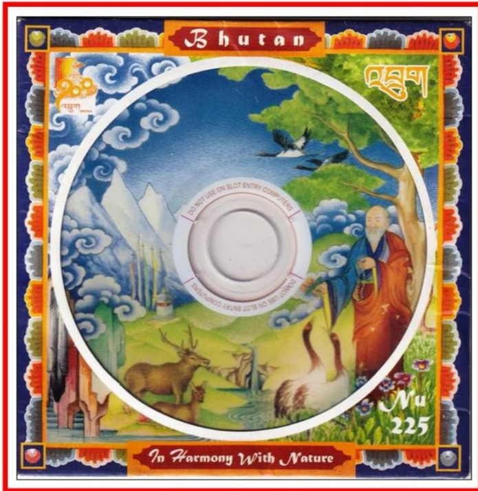
↑ ERROR ↑ Color Variety - The Crane birds and the Brown robe worn by the Monk has faded sienna color. This is Unlisted Error. Only One sighted so far in the world.

Geographical Distribution —Europe, Asia, Africa