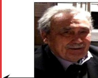
← 1965. Artist Signed Sunken Proof in Black. Wove Paper, Signed by the Artist—PIERRE BEQUET. A French Cartoonist.