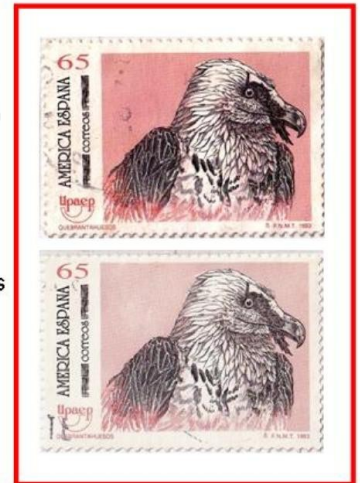
1983. COLOR VARIETY A "UPAEP" ISSUE