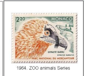
1964. ZOO animals Series