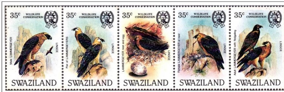
Issued on 16.05.1983, as se-tenant of 5 values for Wildlife conservation.