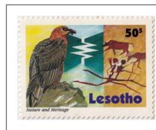
1997.Lsoth Highland Water Project, 4v Set