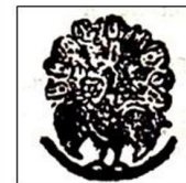
HENZADA TYPE - II

← Counterfeit Official Stamps Block of 4-Ovpt Myaungmya Issue Eight Annas, KG-VI Definitive, Wmk-Elephant Head