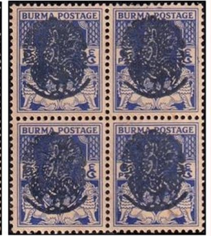
KG-VI 1938 - WMK- ELEPHANT HEAD