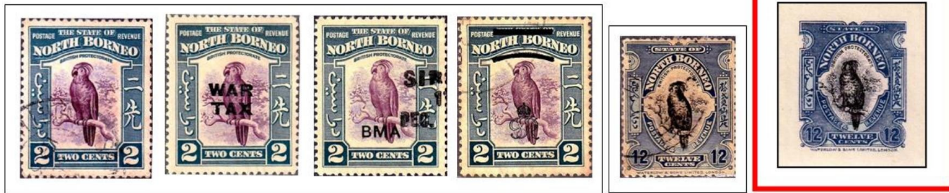
01.01.1939 - Definitive 24.02.1941 Ovpt WAR TAX 17.12.1945-Ovpt BMA 22.12.1947 Ovpt GR 1909 1909 Imperf Proof from Archives

The magnificent wispy crest of the Palm cockatoo gives the bird its distinctive look of a drummer in a rock band.