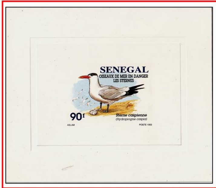
1995. Endangered Birds - Sunken Deluxe Proof

Caspian Tern is one of our cute Birdorable birds! It was added to Birdorable on July 20, 2007. The Caspian Tern is one of our cute Birdorable birds! Caspian Terns are fastidious when it comes to feeding their young. Adults rinse their bills after feeding their babies. If an offered fish is accidentally dropped on the ground, the adult will rinse it off with water before re-offering it to the baby tern.