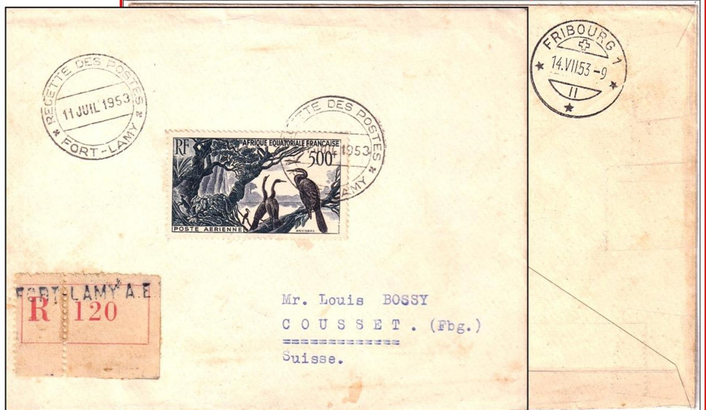
A Registered cover posted to Switzerland Tied with Perforated Yellow label marked R-120, FORT LAMY AE, (now N'D'Jamena) capital of Chad, and is a special salute region encompassing several districts.