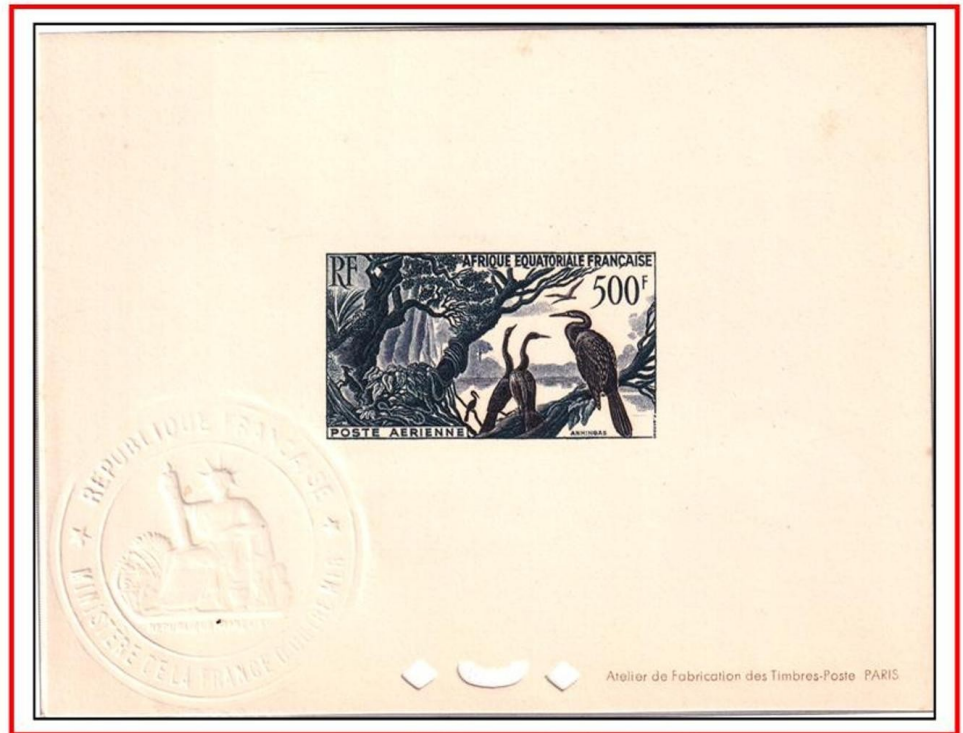
Gravure printed Die Card Carrying Embossed Seal