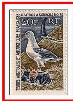
Variety - Frame Off Center