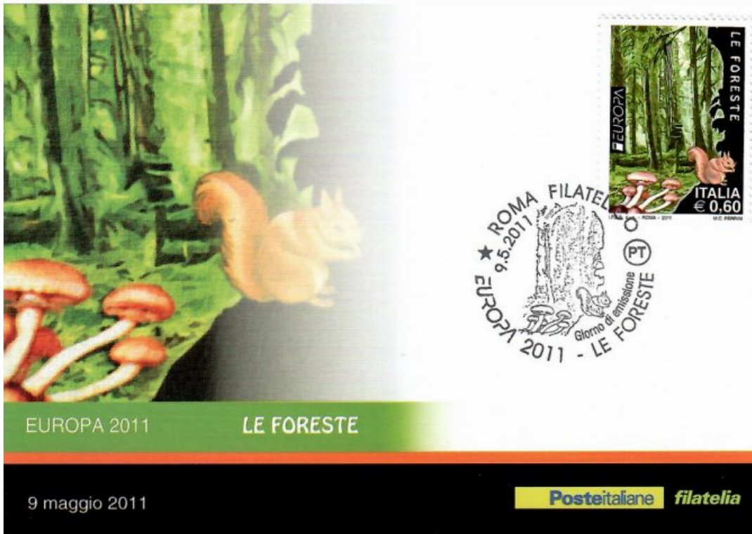
Issue: EUROPA 2011 Forests - Italy Cancellation: Roma 09-05-2011, First day Edition: Italian Post

The ideal habitat for mushrooms always remains the forest, in all its infinite varieties and in all its most articulated and complex expressions. However, there are areas that are more suitable than others for the growth of mushrooms and which therefore present themselves better for research and research collection; they are above all the clearings, the open, illuminated, ventilated spaces, in particular the so-called border strip between meadow and woods.