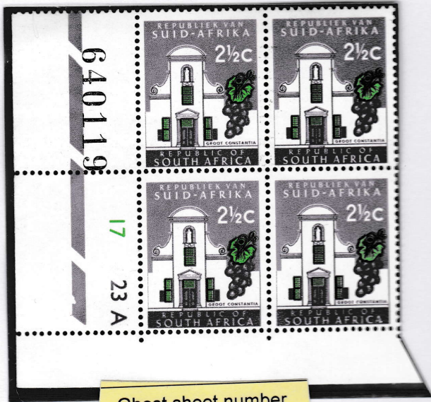
Ghost sheet number