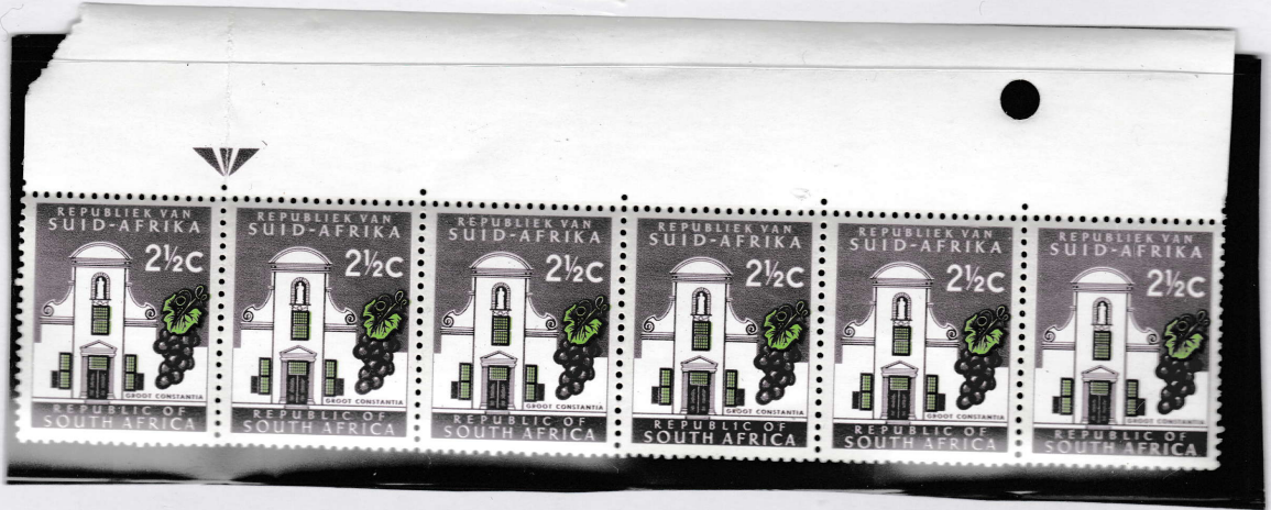
Marginal arrow and perforation punch hole - top.