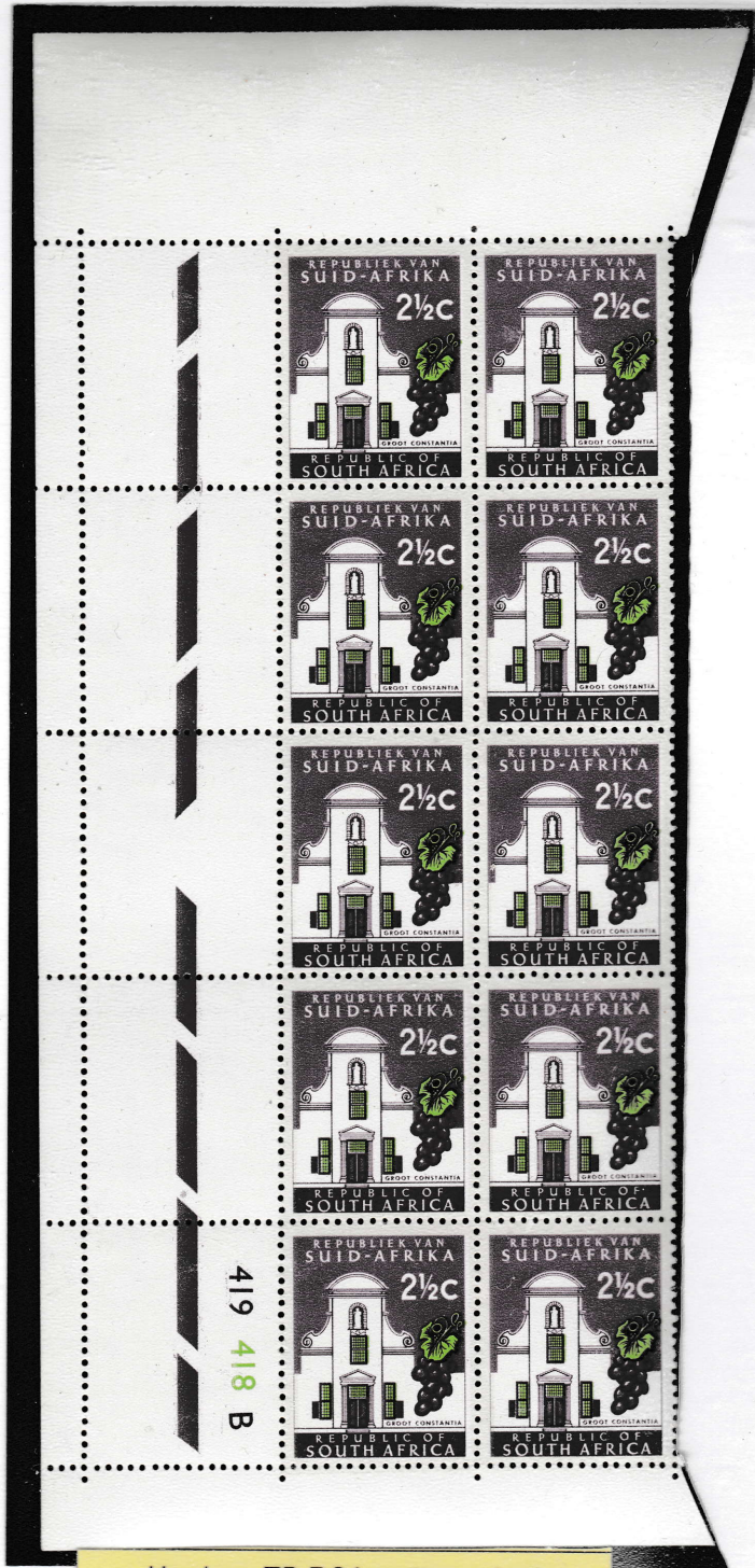
Harrison TB RSA watermarked doubled seen best in top margin where duplication of ▲ and letters RSA reasonably clear is.