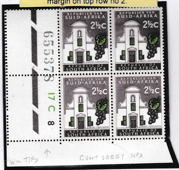
White spots on top left of 10/2 and 9/1, not listed; Ghost no: 856518 on margin on top row no 2.