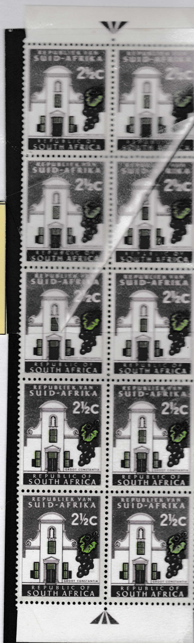
Phosphor band shift.