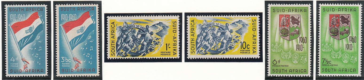
1960 50th Anniversary of Union of South Africa - three values of the commemorative issue In 1961 shortly before becoming a Republic, Union of South Africa the three values of the commemoratives of 1960 were re-issued with new currency

The 1960 whites only referendum had supported Verwoerd's plea for a Republic and the National Party was able to gain a majority in parliament. Verwoerd went to London in March 1961 to give notice to the Conference of Commonwealth Prime Ministers that South Africa was changing from a monarchy to a republic and to argue his case to remain within the British Commonwealth. This request for a constitutional change would normally have been granted, but because of South Africa's Apartheid policy, it was vehemently opposed. Verwoerd then withdrew his application for membership of the Commonwealth.