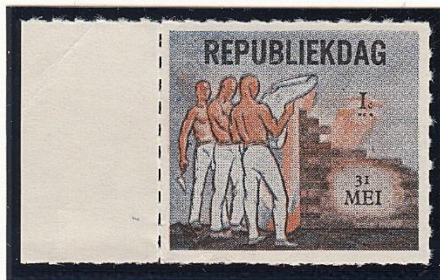
1c 1961 'Republic Day' label sold in booklets of 10 in aid of orphanages, old people's homes & welfare services (Issued by permission of the Postmaster General)

On 31 st May 1961 the Republic of South Africa was established.