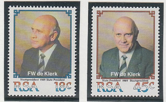
State President F. W. de Klerk inauguration issue 1989

Nelson Mandela was released from prison after 27 years on 11 February 1990. President F.W. de Klerk by 1989 believed that Apartheid was unsustainable and released a number of ANC prisoners, and in 1990 announced Mandela's unconditional release.