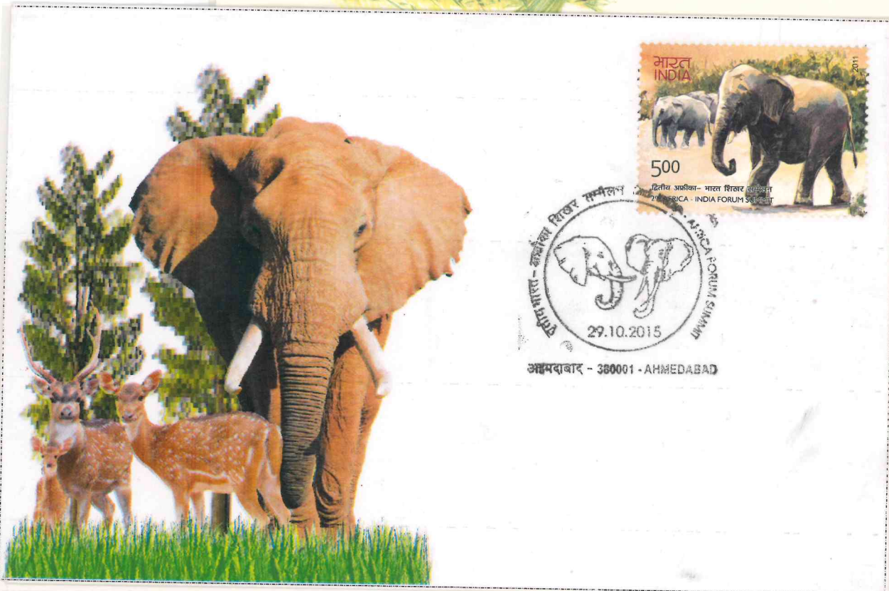
2011 INDIA Asian elephant Special cover Indian Africa summit