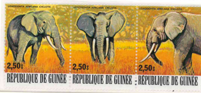
1977 GUINEA- a profile of my cousins

The African Savanna (Bush) elephant is the world's largest land animal – with adult males, or bull elephants, standing up to 3m high and weighing up to 6,000kg and can live for up to 60-70 years.