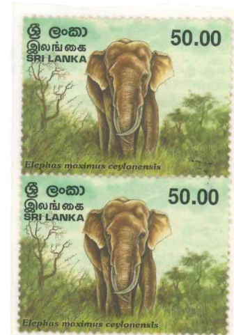
1998 SRI LANKA

The Asian elephants prefer areas with a mix of grasses, low woody plants, and trees, primarily inhabiting dry thorn-scrub forests in southern India and Sri Lanka and evergreen forests in Malaya. Asian elephants are mainly grazers.