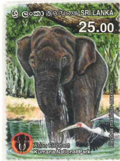
1986 SRI LANKA