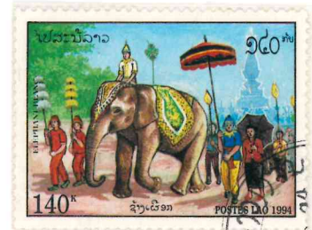
1994 LAOS Procession