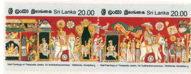
2007 SRI LANKA Royal painting

Elephants are honoured because they have always been important in India. Not only did they work hard as beasts of burden, but they were also allowed to carry kings.