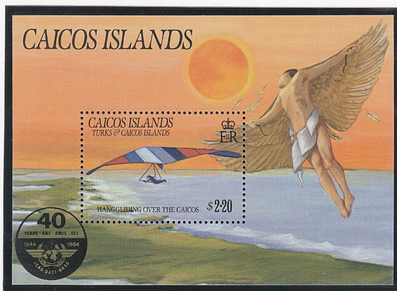
Mythological flight and modern day recreational hang-gilding

Philatelic information on pages in Italics