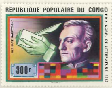
Nobel Prize Winners in Literature

Gerhart Hauptmann(1912): "primarily in recognition of his fruitful, varied and outstanding production in the realm of dramatic art."