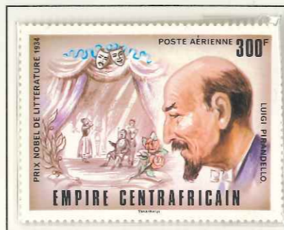
Luigi Pirandello(1934):"for his bold and ingenious revival of dramatic and scenic art."