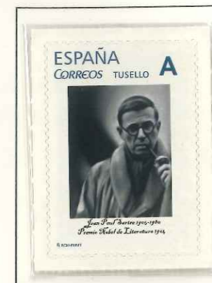
Jean-Paul Sartre(1964):"for his work which, rich in ideas and filled with the spirit of freedom and the quest for truth, has exerted a far-reaching influence on our age."