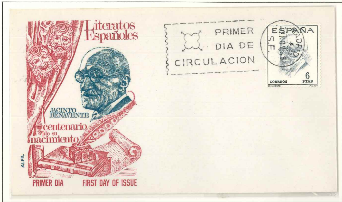
Jacinto Benavente(1922):"for the happy manner in which he has continued the illustrious traditions of the Spanish drama."