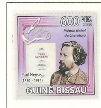
Paul Heyse(1910):"as a tribute to the consummate artistry, permeated with idealism."