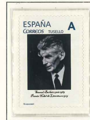
Samuel Beckett(1969):"for his writing, which - in new forms for the novel and drama - in the destitution of modern man acquires its elevation."