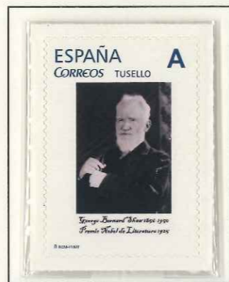
George Bernard Shaw (1925)