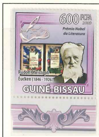
Rudolf Christoph Eucken (1908): "in recognition of his earnest search for truth, his penetrating power of thought, his wide range of vision, and the warmth and strength in presentation."