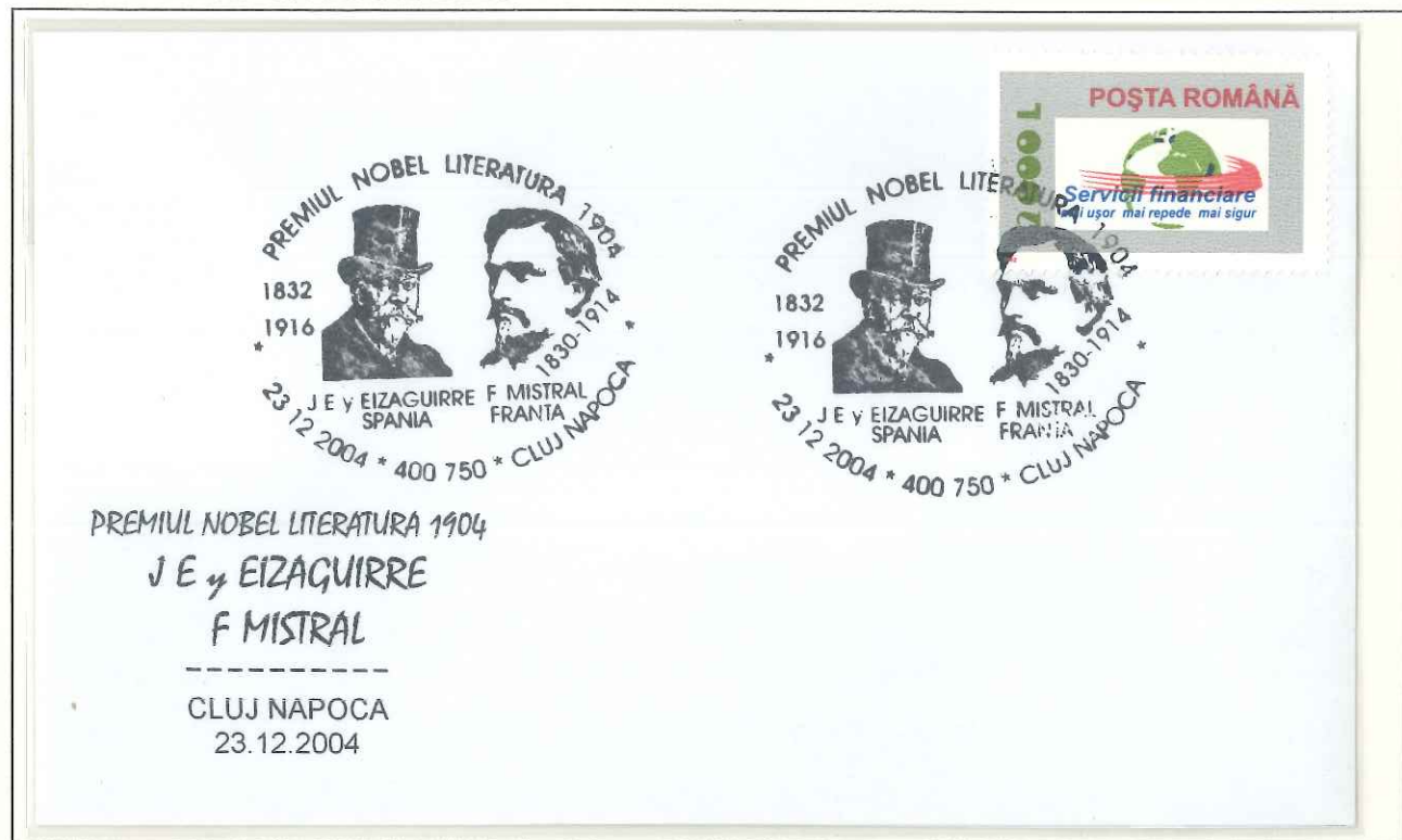
J E Y Eizaguirre (1904) and F Mistral (1904)

J E Y Eizaguirre : "in recognition of the numerous and brilliant compositions which, in an individual and original manner, have revived the great traditions of the Spanish drama"