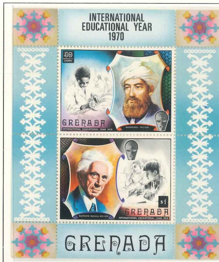
Bertrand Russel (1950): "in recognition of his varied and significant writings in which he champions humanitarian ideals and freedom of thought."