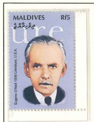
Eugene O' Neill (1936): "for the power, honesty and deep-felt emotions of his dramatic works."

F Mistral (1904): "in recognition of the fresh originality and true inspiration of his poetic production, which faithfully reflects the natural scenery and native spirit of his people, and, in addition, his significant work as a Provençal philologist."