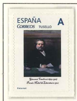
Giosue Carducci(1906): "not only in consideration of his deep learning and critical research, but above all as a tribute to the creative energy, freshness of style, and lyrical force which characterize his poetic masterpieces."