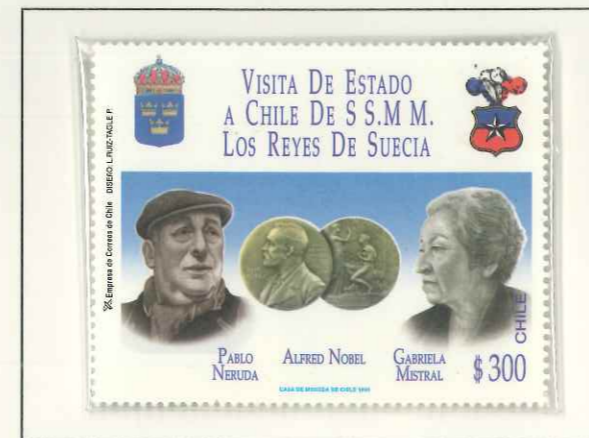
Pablo Neruda(1971) & Gabriela Mistral (1904): "for her lyric poetry which, inspired by powerful emotions, has made her name a symbol of the idealistic aspirations of the entire Latin American world."