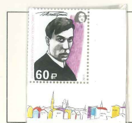
Boris Pasternak (1958) "for significant achievements in contemporary lyrical poetry, as well as for the continuation of the traditions of the great Russian epic novel."