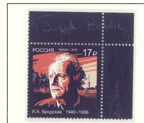
Joseph Brodsky (1987) "for an all-embracing authorship, imbued with clarity of thought and poetic intensity."