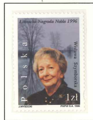
Wislawna Szymborska(1996): "for poetry that with ironic precision allows the historical and biological context to come to light in fragments of human reality."