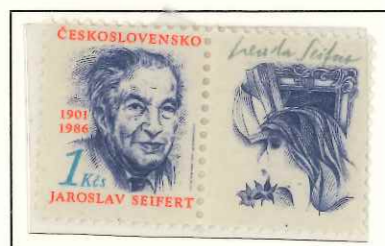
Jaroslav Seifert(1984): "for his poetry which endowed with freshness, sensuality and rich inventiveness provides a liberating image of the indomitable spirit and versatility of man."