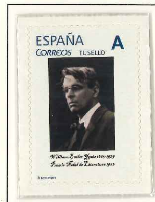
WB Yeats(1923): "for his always inspired poetry, which in a highly artistic form gives expression to the spirit of a whole nation."