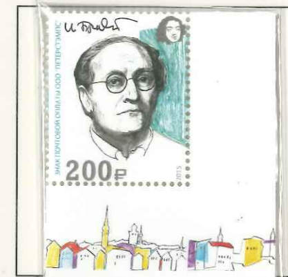
Joseph Brodsky(1987): "for an all-embracing authorship, imbued with clarity of thought and poetic intensity."