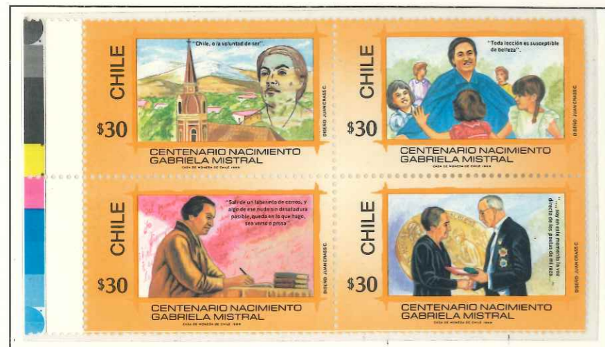
Gabriela Mistral(1945): "for her lyric poetry which, inspired by powerful emotions, has made her name a symbol of the idealistic aspirations of the entire Latin American world."