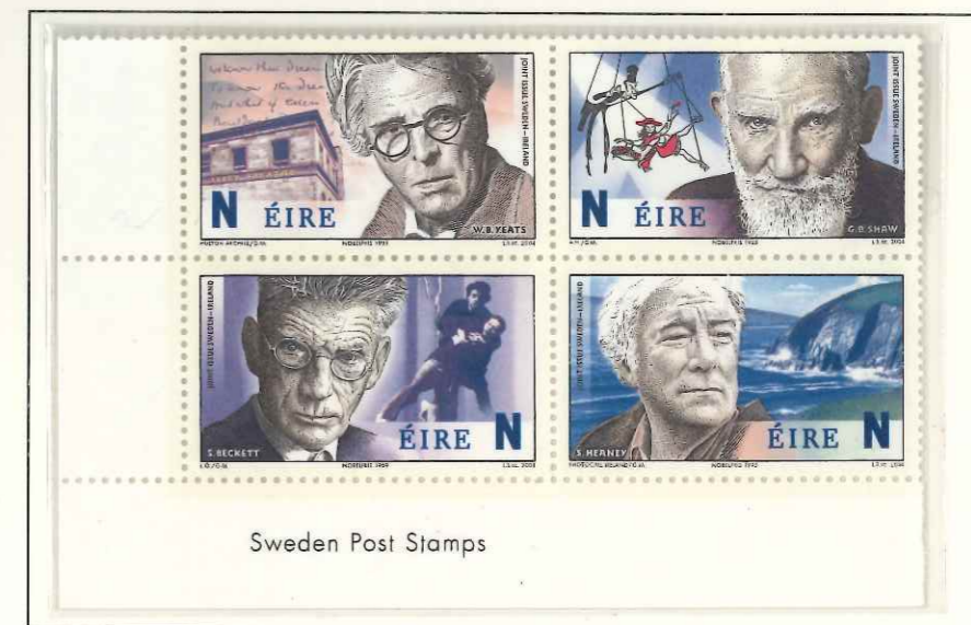
W B Yeats(1923): "for his always inspired poetry, which in a highly artistic form gives expression to the spirit of a whole nation."