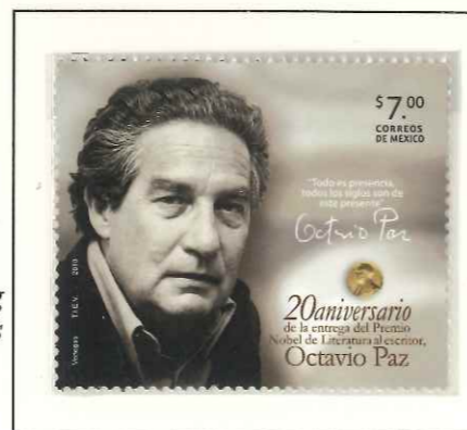
Octavio Paz(1990): "for impassioned writing with wide horizons, characterized by sensuous intelligence and humanistic integrity."