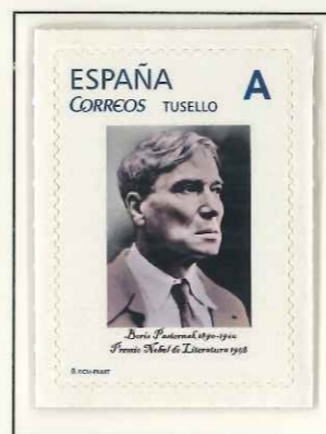
Boris Pasternak (1958) "for his important achievement both in contemporary lyrical poetry and in the field of the great Russian epic tradition."