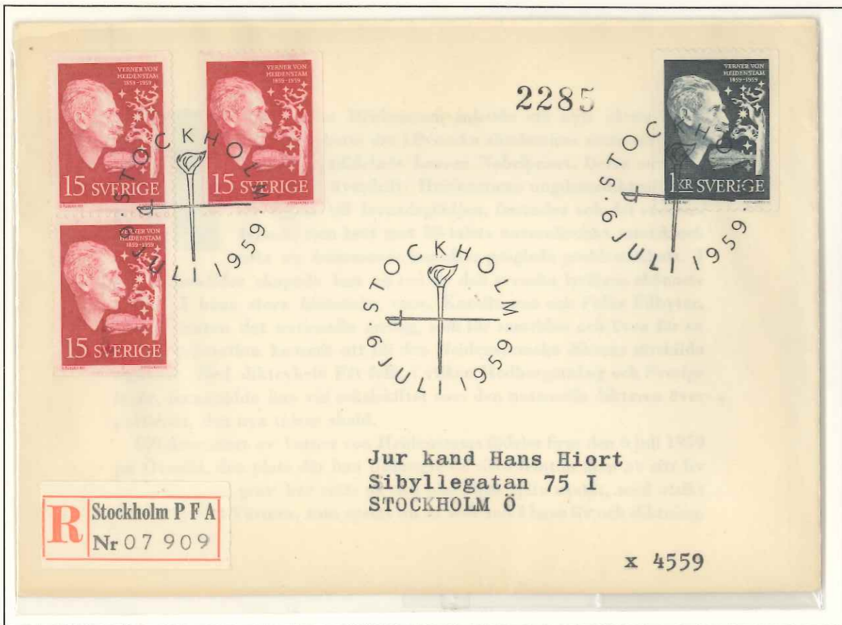
Verner Von Heidenstam (1916): "in recognition of his significance as the leading representative of a new era in our literature."