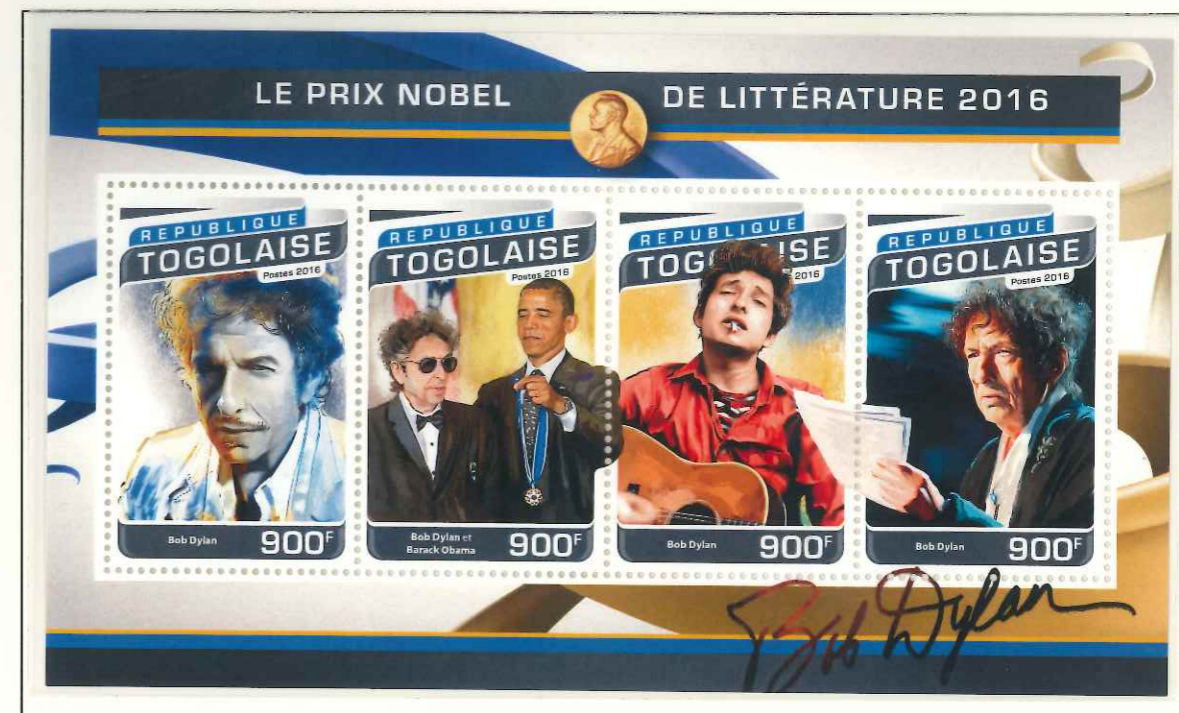
Bob Dylan (2016): "for having created new poetic expressions within the great American song tradition."