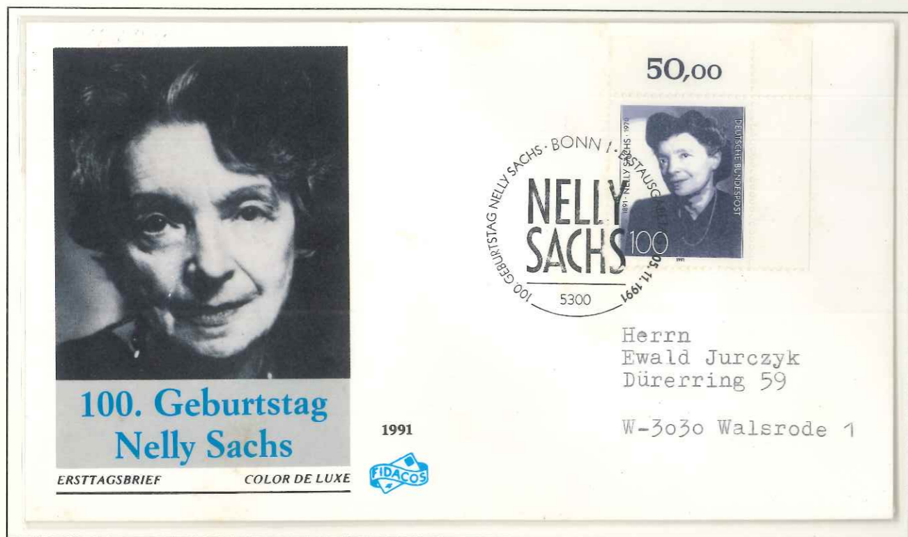
Nelly Sachs (1966): "for her outstanding lyrical and dramatic writing, which interprets Israel's destiny with touching strength."