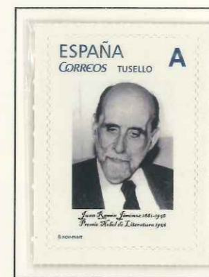
Juan Ramon Jimenez (1956): "for his lyrical poetry, which in Spanish language constitutes an example of high spirit and artistic purity."