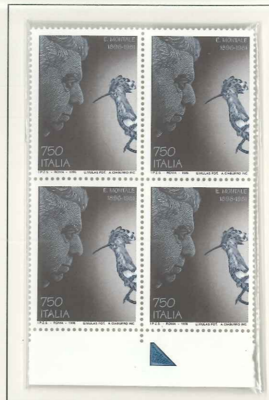
Eugenio Montale (1975): "for his distinctive poetry which, with great artistic sensitivity, has interpreted human values under the sign of an outlook on life with no illusions."