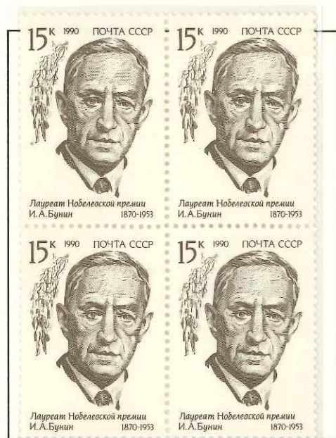
Ivan Bunin(1933): "for the strict artistry with which he has carried on the classical Russian traditions in prose writing."