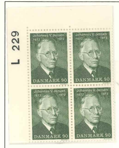
Johannes V Jensen(1944): "for the rare strength and fertility of his poetic imagination with which is combined an intellectual curiosity of wide scope and a bold, freshly creative style."