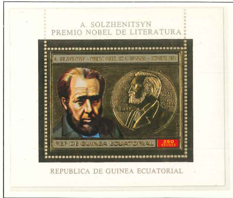
Aleksandr Solzhenitsyn(1970): "for the ethical force with which he has pursued the indispensable traditions of Russian literature."