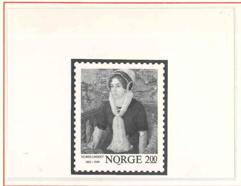
Sigrid Undset(1928): "principally for her powerful descriptions of Northern life during the Middle Ages."