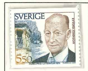
Eyvind Johnson(1974): "for a narrative art, far-seeing in lands and ages, in the service of freedom."