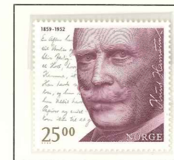
Knut Hamsun(1920): "for his monumental work, Growth of the Soil ."