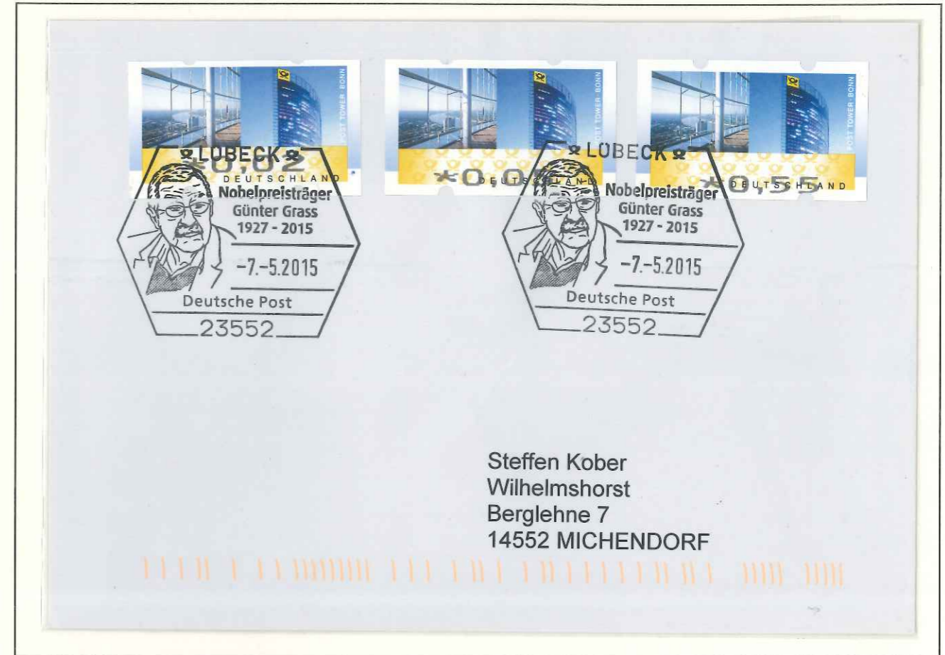
Gunter Grass(1999): "whose frolicsome black fables portray the forgotten face of history."