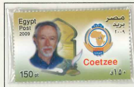
John M. Coetzee(2003): "who in innumerable guises portrays"