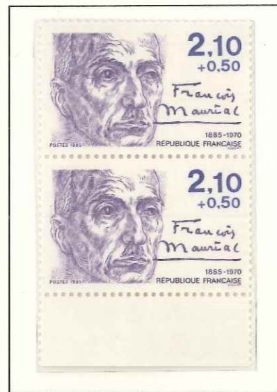
Francois Mauriac(1952): "for the deep spiritual insight and the artistic intensity with which he has in his novels penetrated the drama of human life."