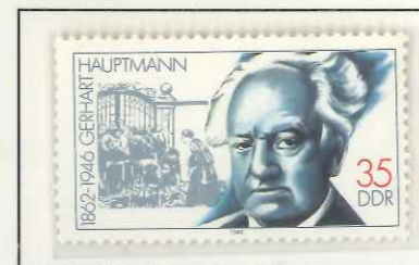
Gerhart Hauptmann(1912): "primarily in recognition of his fruitful, varied and outstanding production in the realm of dramatic art."