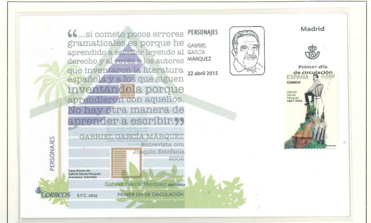
Gabriel Garcia Marquez(1982): "for her lyric poetry which, inspired by powerful emotions, has made her name a symbol of the idealistic aspirations of the entire Latin American world."