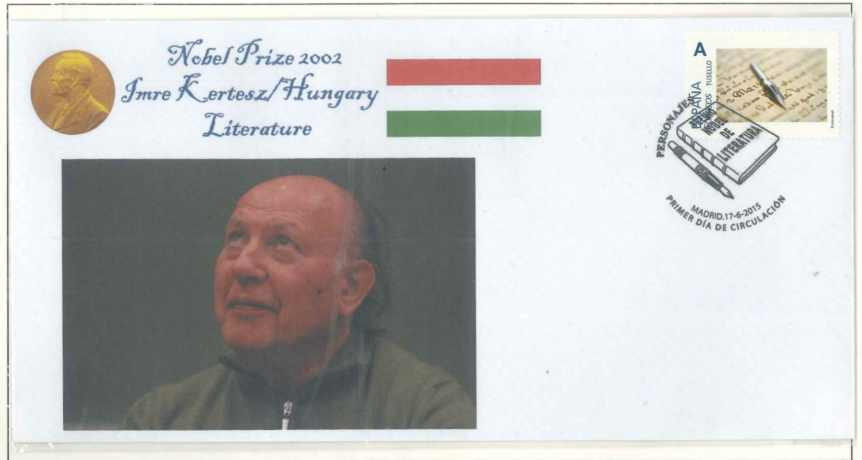
Imre Kertesz(2002): "for writing that upholds the fragile experience of the individual against the barbaric arbitrariness of history."