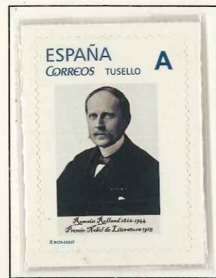
Romain Roland(1915): "as a tribute to the lofty idealism of his literary production and to the sympathy and love of truth with which he has described different types of human beings."