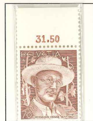
Hermann Hesse(1946): "for his inspired writings which, while growing in boldness and penetration, exemplify the classical humanitarian ideals and high qualities of style."