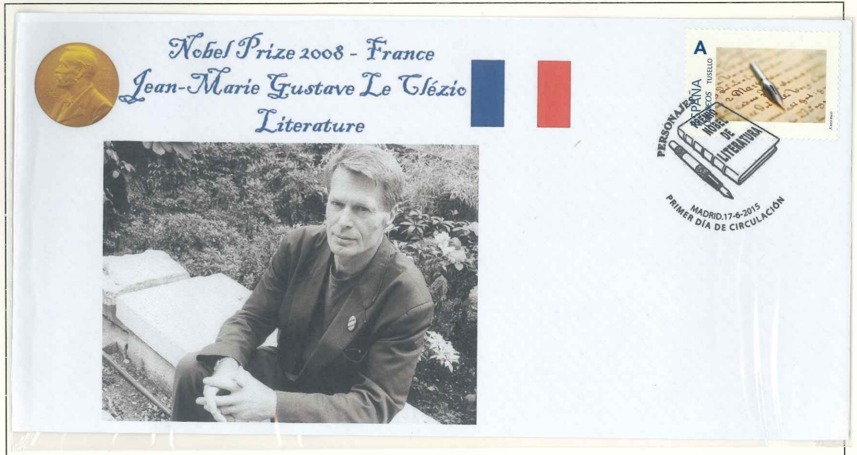
Jean Marie Gustave Le Clezio(2008): "author of new departures, poetic adventure and sensual ecstasy, explorer of a humanity beyond and below the reigning civilization."