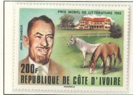
John Steinbeck (1962):"for his realistic and imaginative writings, combining as they do sympathetic humour and keen social perception."