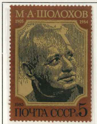
Mikhail Alek Sholokhov (1965):"for the artistic power and integrity with which, in his epic of the Don , he has given expression to a historic phase in the life of the Russian people."