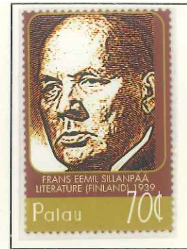
Frans Eemil Sillanpää (1939):"for his deep understanding of his country's peasantry and the exquisite art with which he has portrayed their way of life and their relationship with Nature."