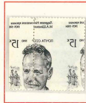
Shifted mirror print on gum side