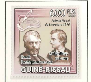
Henrik Pontoppidan (1917): "for his authentic descriptions of present-day life in Denmark" & Karl Gjellerup (1917):"for his varied and rich poetry, which is inspired by lofty ideals."