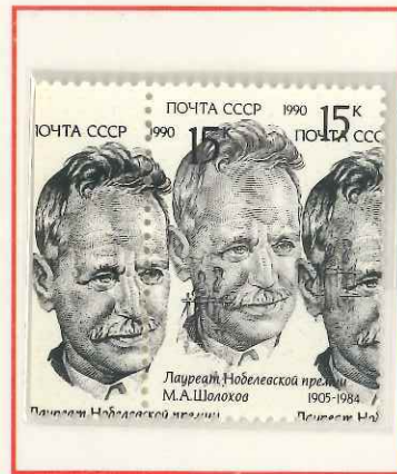
M A Sholokov, double print