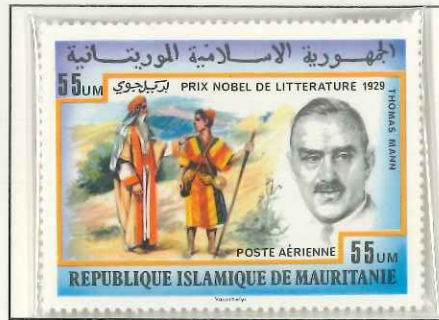
Thomas Mann (1929):"principally for his great novel, Buddenbrooks , which has won steadily increased recognition as one of the classic works of contemporary literature."