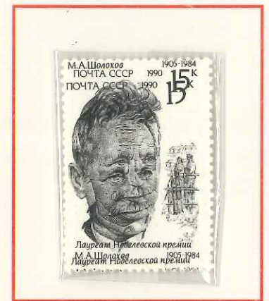
M A Sholokov, double print