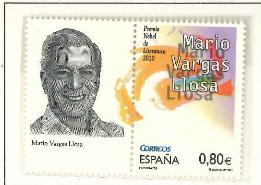
Mario Vargas Llosa (2010):"for his cartography of structures of power and his trenchant images of the individual's resistance, revolt, and defeat."