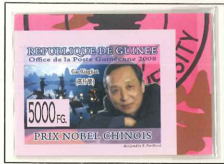
Gao Xingjian (2000)"for an œuvre of universal validity, bitter insights and linguistic ingenuity, which has opened new paths for the Chinese novel and drama."