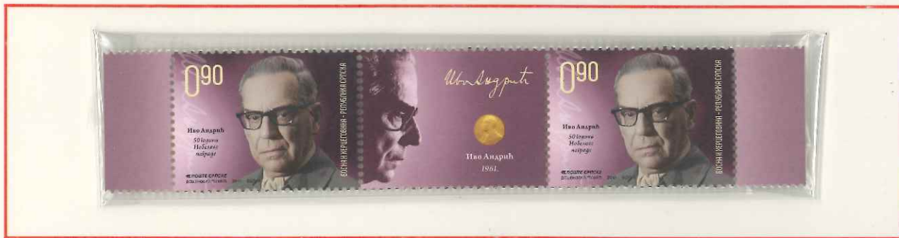
Print without control no