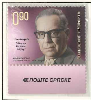
Ivo Andrić (1961) ERROR - WITHOUT STATE NAME:"for the epic force with which he has traced themes and depicted human destinies drawn from the history of his country."