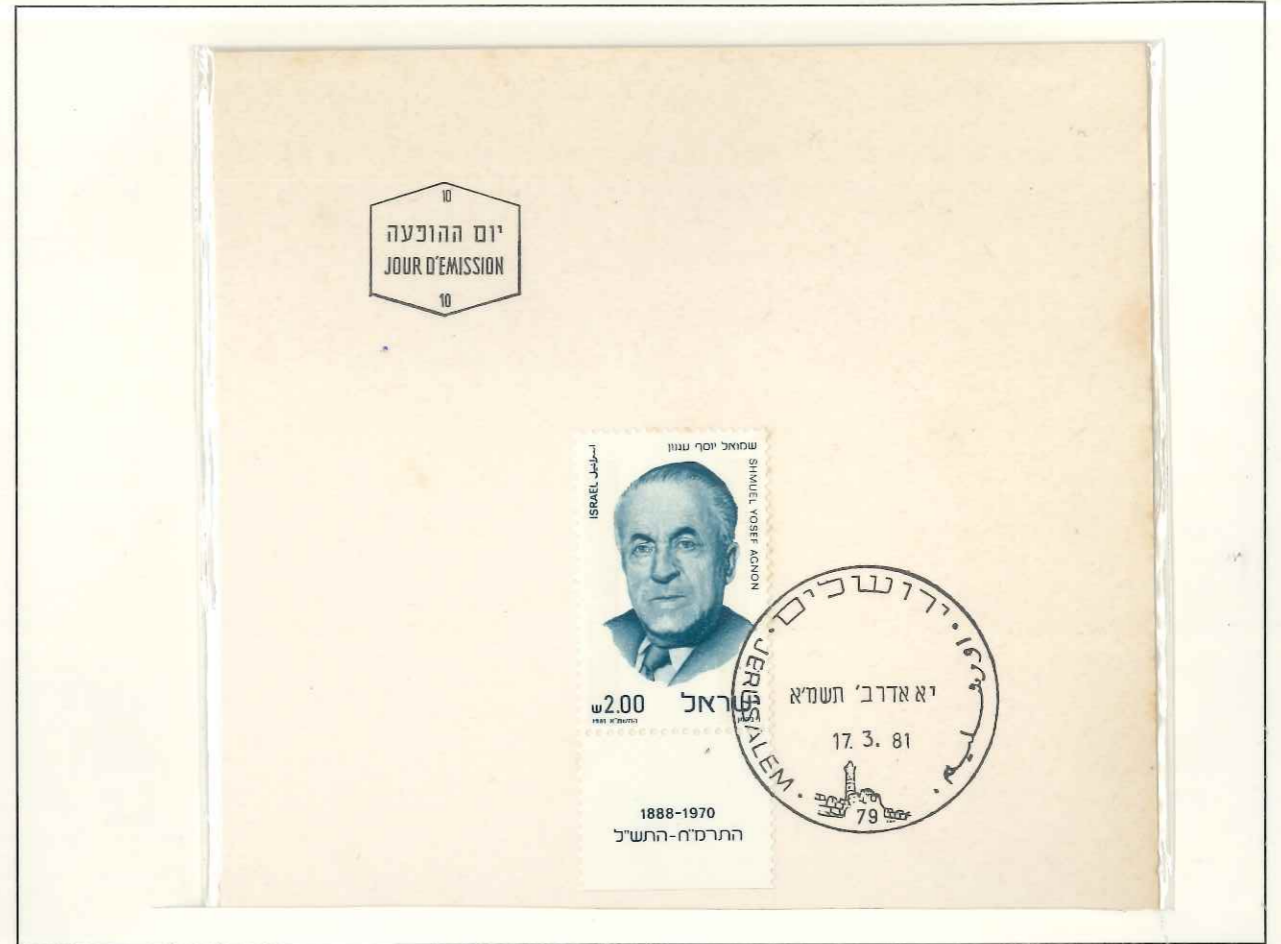
Shmuel Yosef Agnon (1966): " for his profoundly characteristic narrative art with motifs from the life of the Jewish people. "