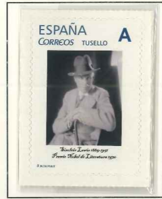
Sinclair Lewis (1930): " for his vigorous and graphic art of description and his ability to create, with wit and humour, new types of characters. "