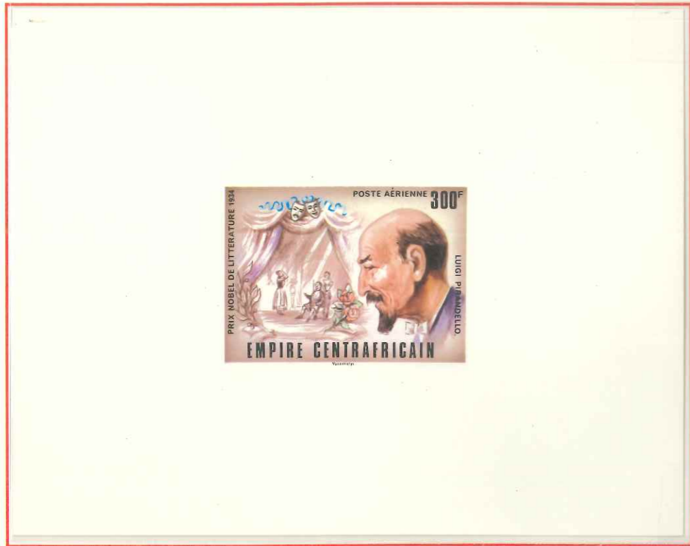
Luigi Pirandello (1934): " for his bold and ingenious revival of dramatic and scenic art. "