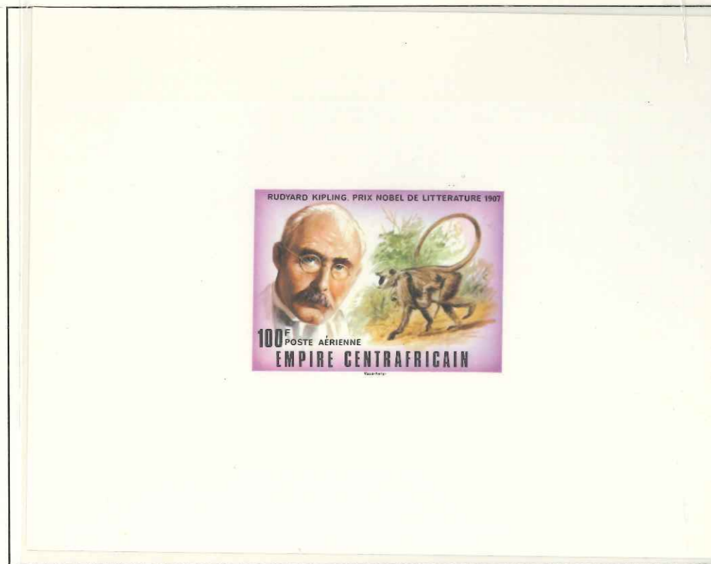
Rudyard Kipling (1907): " in consideration of the power of observation, originality of imagination, virility of ideas and remarkable talent for narration which characterize the creations of this world-famous author. "