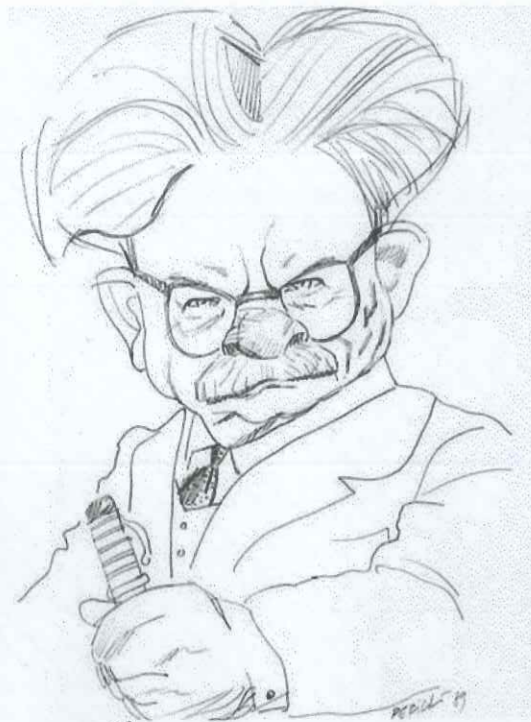
Elias Canetti 1905-1994 Premio Nobel de Literatura 1981