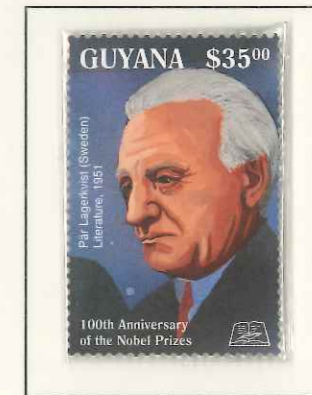
Par Lagerkvist(1951):"for the artistic vigour and true independence of mind with which he endeavours in his poetry to find answers to the eternal questions confronting mankind."