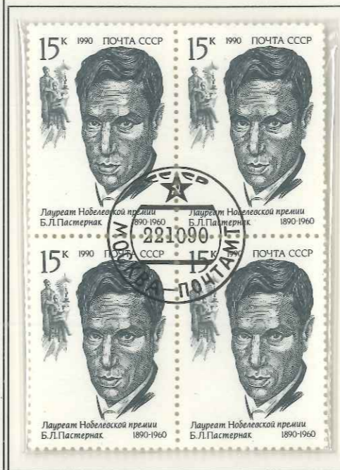
Boris Pasternak (1958) "for significant achievements in contemporary lyrical poetry, as well as for the continuation of the traditions of the great Russian epic novel."