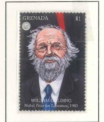
William Golding (1983):"for his novels which, with the perspicuity of realistic narrative art and the diversity of myth, illuminate the human condition in the world of today."

Nobel Prize 1976 Saul Bellow/ U. S. A. Literature