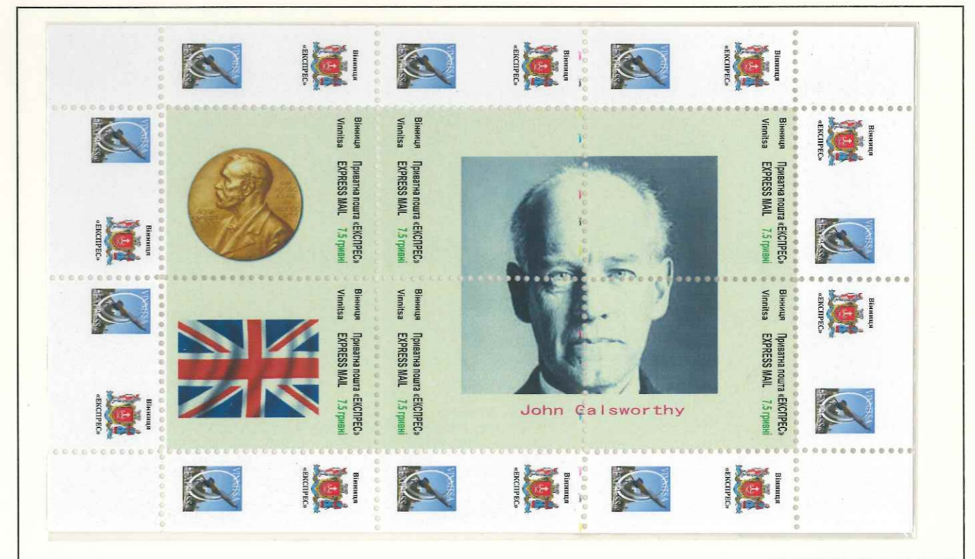
John Galsworthy(1932):"for his distinguished art of narration which takes its highest form in The Forsyte Saga."