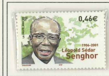
LEOPOLD SEDAR SENGHOR, FRANCE, 1906-2001, 2002