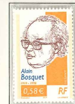
ALAIN BOS- QUET, WRIT- ER, FRANCE