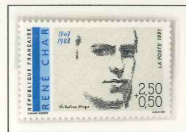
RENE CHAR, POET, FRANCE 1907-1988