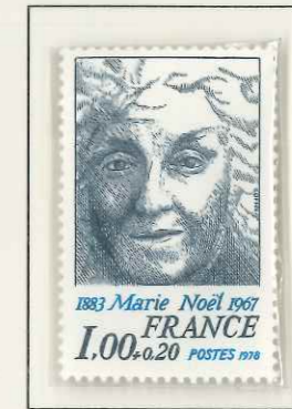
MARIE NOEL, POET, 1978 FRANCE, 1883-1967