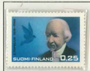
ZACHARIS TOPETIUS, WRITER 1961