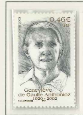
GENEVIEVE DE GAULLE ANTHONIOZ, 1920-2002; 12.2.2003