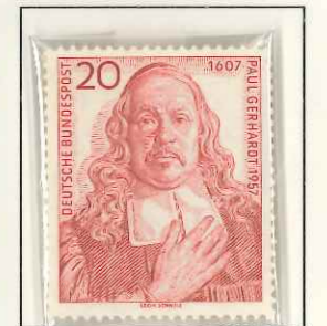
PAUL GERHRDT, HYMN WRITER, FRANCE ;1957