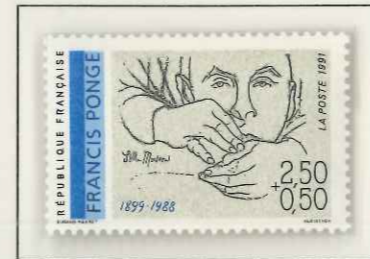
FRANCIS PONGE, POET, FRANCE, 1899-1988