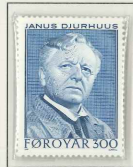
JANUS DJURHUUS First FAROE Island Poet