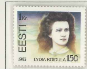
LYDIA KOIDU- LA, WRIT- ER, ESTONIA; 14.12.1974