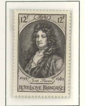
RACINE DRAMATIS, FRANCE 1949