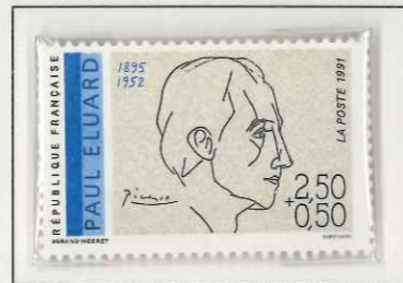
PAUL ELUARD, POET, FRANCE, 1895-1952