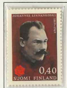
JOHANNES LINNAN ROSKI, WRITER 1969