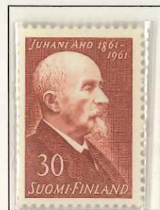
JUHANI AHO, WRITER, SUOMI- FINLAND 1961