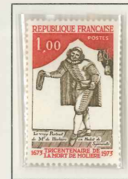
MOLIERE Playwright France 1973