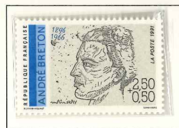
ANDRE BRETON, POET, FRANCE, 1896-1966