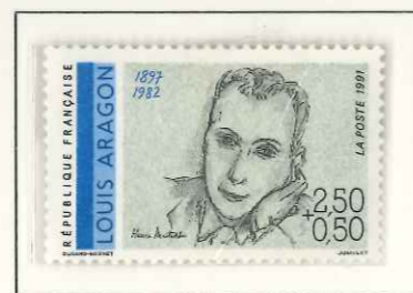
LOUIS ARAGON, POET, FRANCE, 1897-1982