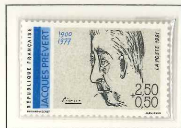
JACQUES PREVERT, POET, FRANCE, 1900-1977