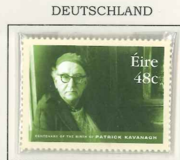
PATRICK RAVANAGH, IRELAND, POET, 2004