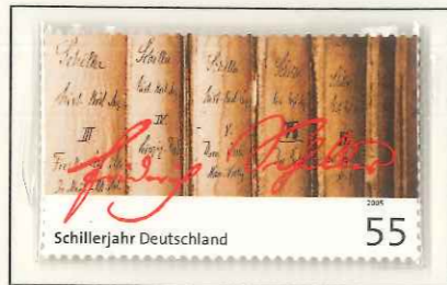
SCHILLERJAHR DEUTSCHLAND 9.5.1955