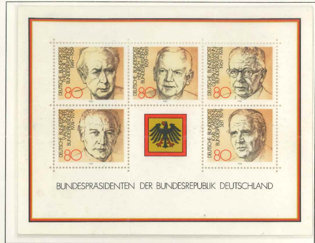
BUNDESPRÄSIDENTEN DER BUNDESREPUBLIK DEUTSCHLAND