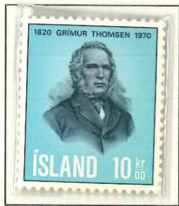
GRIMUR THOMSEN 1970