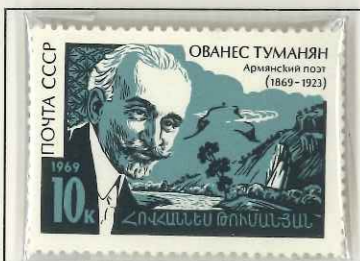
D. TUMANYAN, ARMENIAN POET 1969