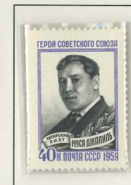
MESA DJALIL, TATAR POET 1959