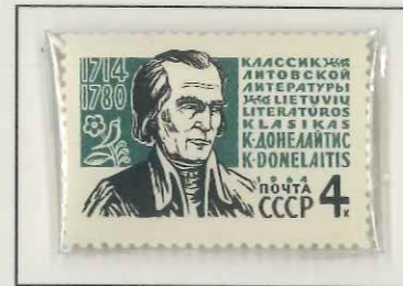
K. DONELAITIS, LITHUVANIAN POET 1964