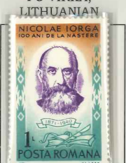
NICOLAE IORGA, 1871-1940