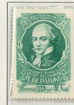
DERANGAR, FRENCH POET, 1957