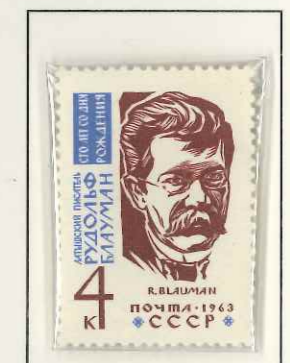
JOROSLAV HASEK, WRIT- ER, 1963