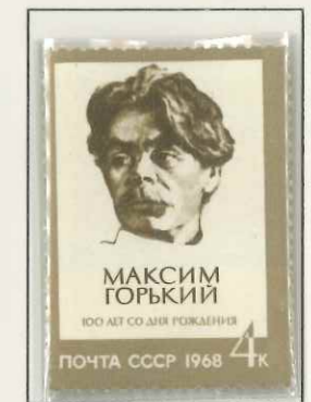
MAXIM GORKY 1968