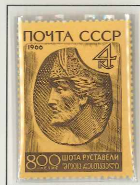
SHOPA RUSTAVELI, GEORGIAN POET 1966