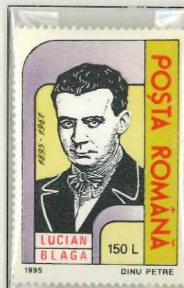
LUCIAN BLAGA, 1895-1961, WRITER.