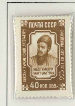
MAHTUMKULI, TURKISTAN WRITER 1959