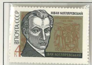
IVAN KOTLYAREVSKY, UKRIAN WRITER 1969