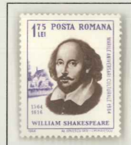
WLLIAM SHAKESPEARE, ROMANIA DRAMA- TIST 20.6.1964