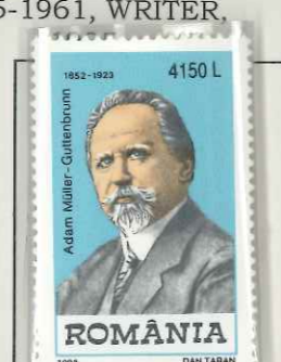
ADAM MULLER GUTTENBRUNN, (1852-1923); 1998