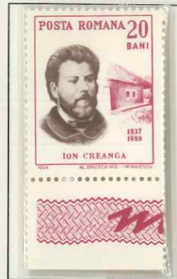
ION CREANGA, FOLKLORIST, ROMANIA 20.6.1964