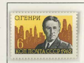
SABIR AZERBAIZAN POET 1962