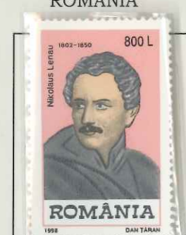
NIKOLAUS LENAU, (1802-1850); 1998