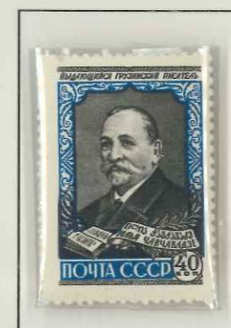
SADRUDDIN AINI, TADZHIK WRITER, 1958