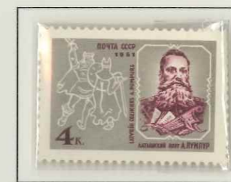
PONPUR, LETTISH POET 1961