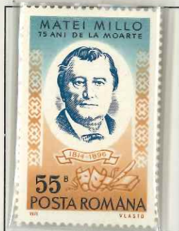
MATEI MILLO, (1814-1896); 1971