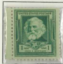
HENRY W. LONGFELLOW