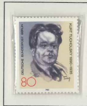
KURT TUCHOLSKY 12.11.1985