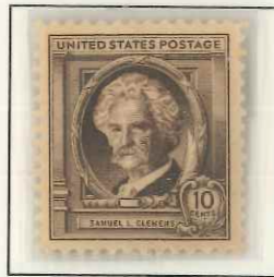
SAMUEL L. CLEMENS