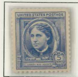
LOSIA MAY ALCOTT