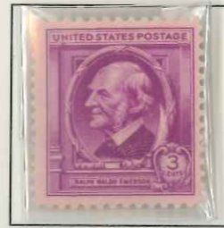
RALPH WALDO EMERSON