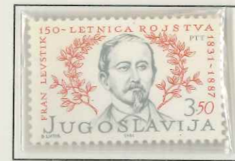
FRAN LEVSTIK, WRITER, 1831-1887); 1981