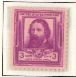
JAMES RUSSEL LOWELL