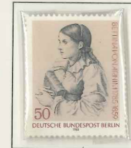
BETTINA VON AR- NIM, POETESS 21.2.1885