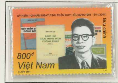
TRAN LIEU, VIETNAM 2001