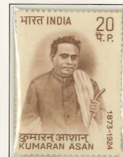
KUMARAN ASAN Wrote several works in Malayalam (12.4.1973).