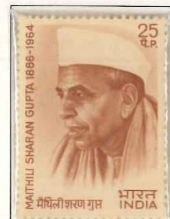
MAITHILI SARAN GUPTA (3.8.1886-12.12.1964) Wrote in Khari Boli and known as Rashtrakavi, author of 'Saket' & 50