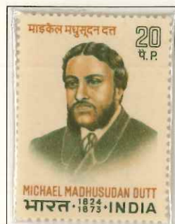
MICHAEL MADHUSUDAN DUTT (25.1.1824-29.6.1879) Poet & dramatist and first one to write Bengali plays in English (21.7.1973).