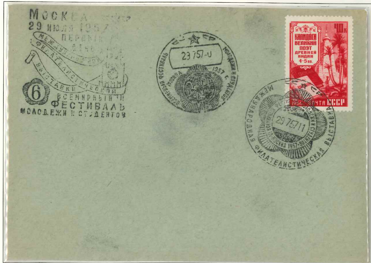
KALIDASA, INDIAN POET SPECIAL COMMEMORATIVE COVER, 1957 ISSUED BY RUSSIA