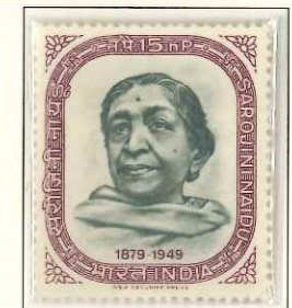
SAROJINI NAIDU (13.2.1879-2.3.1949) Earned sobriquet 'Nightingale of India' for her poems that ran into volumes (13.2.1964).