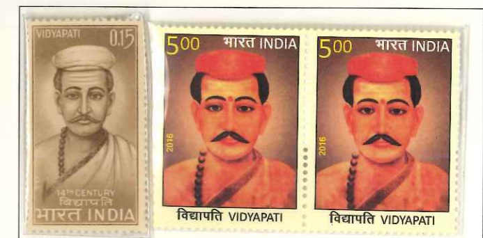
VIDYAPATHI (1352-1448) Wrote 'Padavalis' in Maithili which are prayers to Lord Siva & wrote other books (17.11.1965 & 26.8.2016).