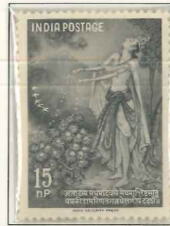
KALIDASA – YAKSHA IN 'MEGHDUTA'