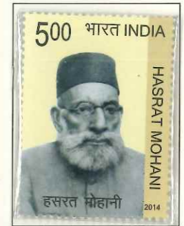
HASRAT MOHANI (1.1.1875-13.5.1951) A noted Urdu poet wrote few books. 'Chupke chupke Raat' ghazal was penned by him (25.2.2014).

This was the first revalued commemorative stamp of India (22.6.1960).