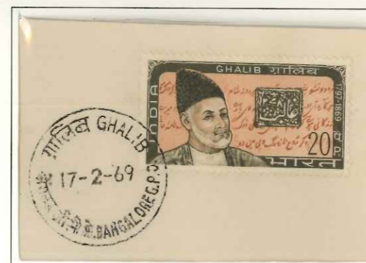
GHALIB (27.12.1797 15.2.1869) Wrote 1742 couplets in Urdu & 11340 in Persian (17.2.1969).