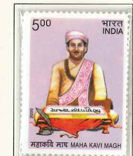
MAHAKAVI MAGH A 7th C. Sanskrit poet wrote epic poem Shishupala Vadha