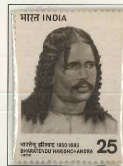
BHARATENDU HARISH CHANDRA (9.9.1950-6.1.1885) Father of modern Hindi literature & Theatre, wrote 5 plays, 12 poetry books, 5 translations (9.9.1976).