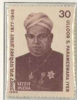
ULLOOR PARAMESWARA IYER (6.6.1877-15.6.1949) Wrote many books (Bhakthi deepika, Chithrasala Etc.) (6.6.1980).