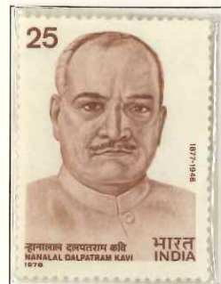
NANALAL DALPATRAM KAVI (16.3.1877-9.1.1946) Wrote more than 80 books, considered as father of Gujarati poetry (16.3.1978).