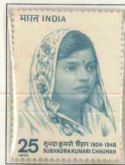
SUBHADRA KUMARI CHAUHAN Wrote poetry, short stories, poetic eulogy, Jhansi ki Rani