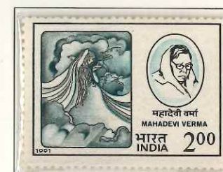
MAHADEVI VARMA A poet, painter and a short-story writer considered as modern Meera (16.9.1991).