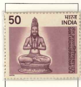
ARUNA GIRINATHAR A Tamil poet wrote Tiruppugazh with 16000 songs & wrote books (14.8.1975).