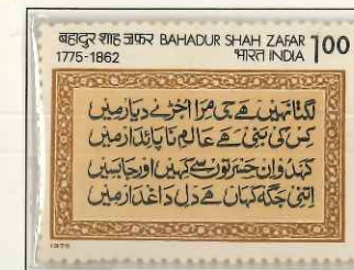
POEM OF BAHADURSHA JAFAR Wrote large number of Ghazals (Kulliat-I-Jafar) (24.10.1975).