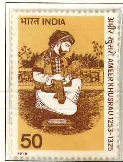
AMEER KHUSRAU wrote in Persian & Hindavi in many verse forms and author of Khamsha (24.10.1975).