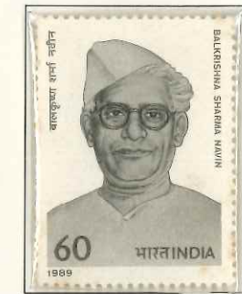
BALKRISHNA SHARMA NAVIN (b. 8.12.1897) Wrote Kumkum, Rashmirekha, Apalak etc. (8.12.1989).