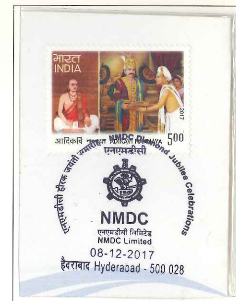
ADIKAVI NANNAYA A poet of 11th C who wrote Andhra Mahabharatam and first treatise on Telugu grammar (2017).