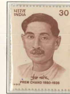
PREM CHAND Born Dhanpat Rai Srivastav, wrote over 300 stories, 15 novels & translations (31.7.1980).