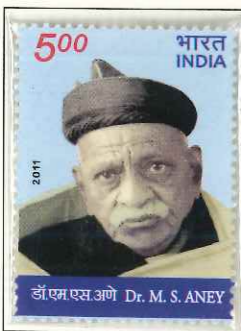
DR M.S.ANEY (29.8.1880-26.1.1968) Poet (Poem Tilak Yashma (29.8.2011).