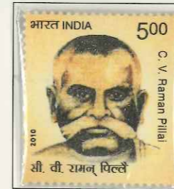
CV RAMAN PILLAI (19.5.1858-21.3.1922) In all he wrote 6 novels, 11 plays, 3 translations (19.5.2010).