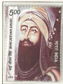
BABA JEEVAN SINGH (1649-1705) Poet & Warrior (23.12.2010).