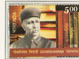
GOVARDHANRAM TRIPATHI (1855-1907) Gujarati novelist, wrote Saraswatichandra novel