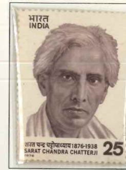
SARAT CHANDRA CHATTERJI (15.9.1876-16.1.1938) Bengali novelist & short story writer, wrote many books (15.9.1976).