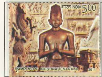
KRISHNADEVARAYA (16.2.1471-1529) Wrote Amuktamalyada (27.1.2011).