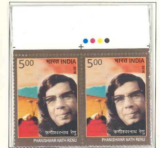
PHANISHWARNATH 'RENU' (1921-1977) Wrote Mailla Anchal novel (26.8.2016)