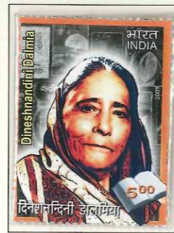
DINESHNANDINI DALMIA (16.2.1928-25.10.2007) The author of more than 35 novels and an equal number of poetical works. (11.10.2009).