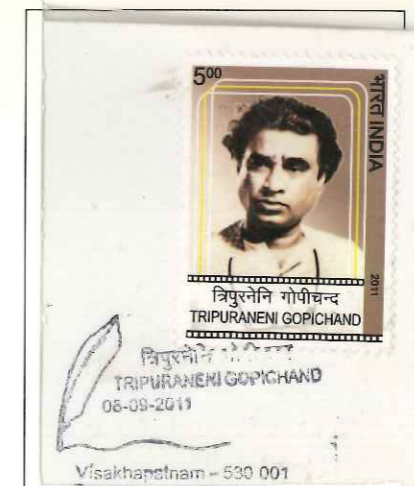
TRIPURANENI GOPICHAND (8.9.1910-2.11.1962) Wrote 11 novels, 4 non-fiction & other works (8.9.2011)