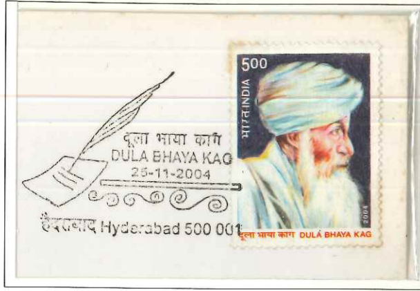
DULA BHAYA KAG (25.11.1902-22.2.1977) Published 'Kagvani' in light volumes based on Ramanyan & Mahabharat (25.11.2004)